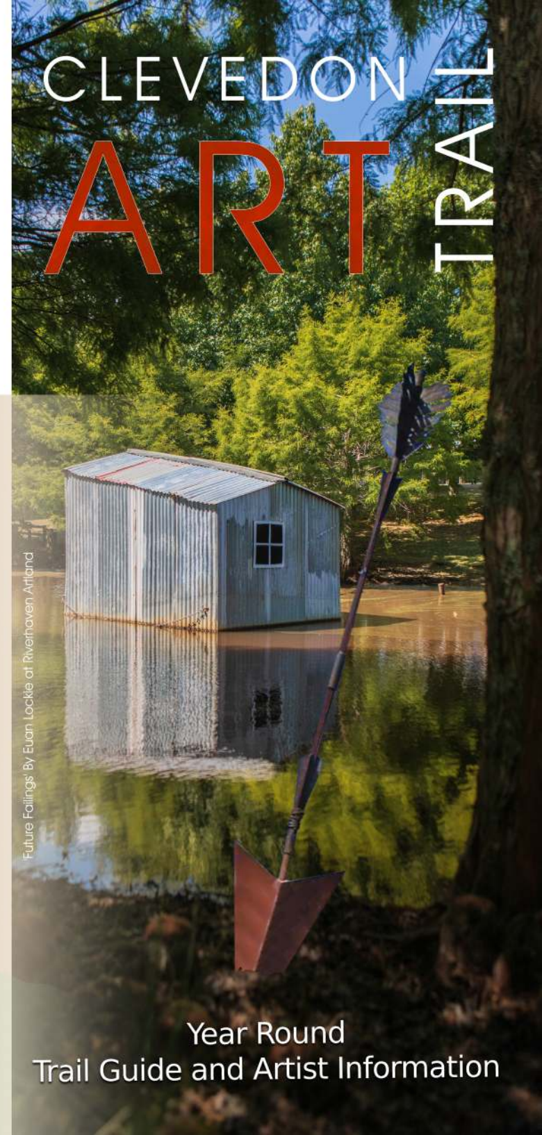
Future Fallings By Euan Locke at Riverhaven Artland

Year Round Trail Guide and Artist Information